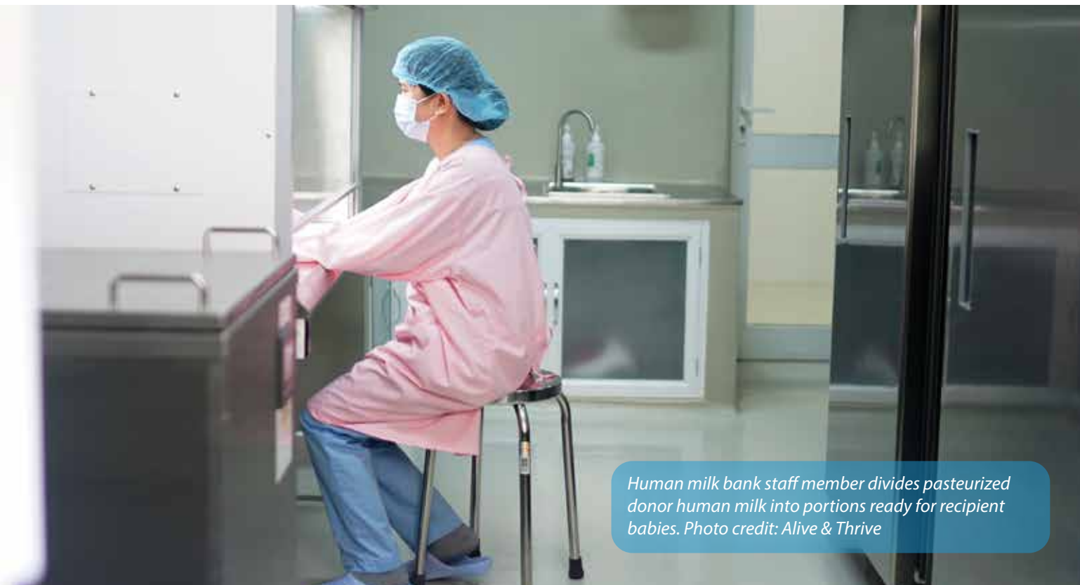
Human milk bank staff member divides pasteurized donor human milk into portions ready for recipient babies.

WHO. Guidelines on optimal feeding of low birth-weight infants in low- and middle-income countries. Geneva, World Health Organization; 2011. Available from www.who.int/elena/titles/full_recommendations/feeding_lbwt/en .