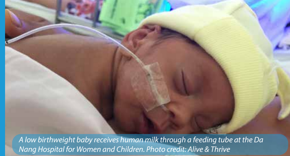
A low birthweight baby receives human milk through a feeding tube at the Da Nang Hospital for Women and Children.